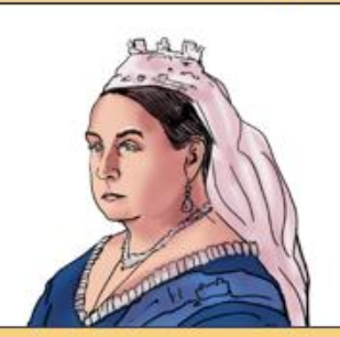
Queen Victoria 1837